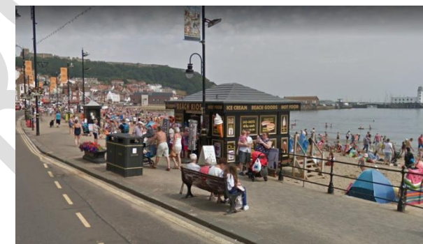
Above, Whitby, Top Right Scarborough bottom Right Thornton Le Dale – Home of Bangers & Cash and Mathewsons Auction House