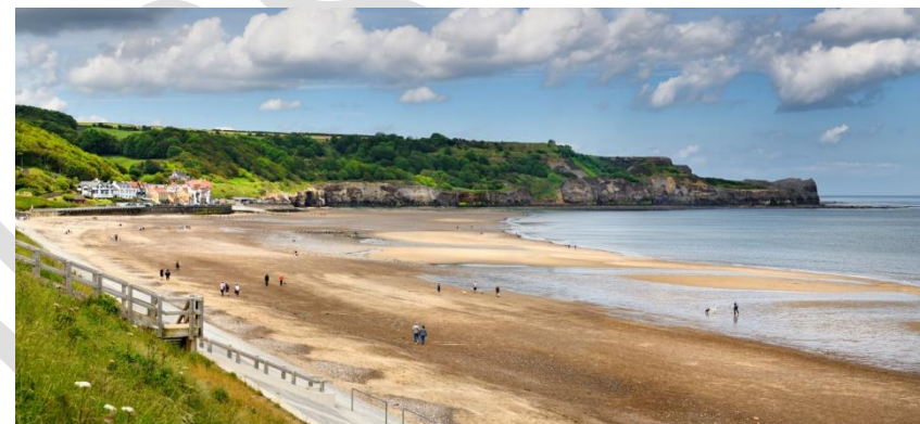
Above – Sandsend, Below; Goathland, – Heartbeat Village